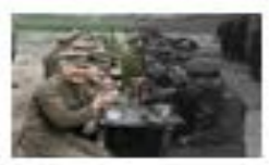
How do we remember WWI?