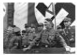
How did the Nazis consolidate their power?