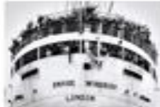
How much discrimination did the Windrush generation face?