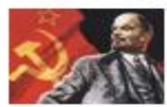
Why was there a revolution in Russia in 1917?