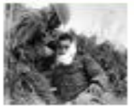
How did Medicine develop in the Trenches?