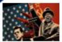
What caused the Cold War?