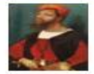
What were our ancestors like?