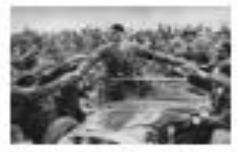
Why was Hitler able to win popular support?