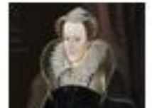
Who was Mary Queen of Scots?