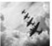
Was the Battle of Britain a turning Point?