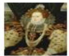
How did Elizabeth deal with religious division?