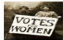
How did Women win the right to vote?