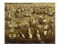
Why did the Spanish Armada fail?