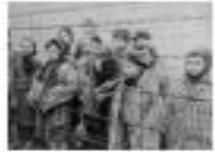
What factors led to the Holocaust?