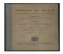
Was the Treaty of Versailles too harsh on Germany?