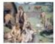
Who are the British?