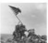
How did the Allies win the Second World War?