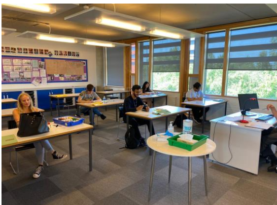
Year 12 Government and Politics