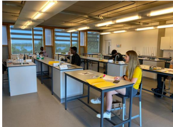
Year 12 Biology